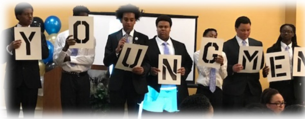
Young Women's & Young Men's Ministries Sunday May 19th, 2019