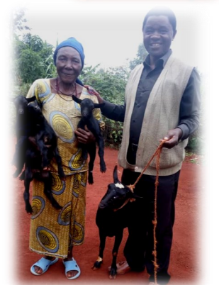
Goat Delivers Three Kids